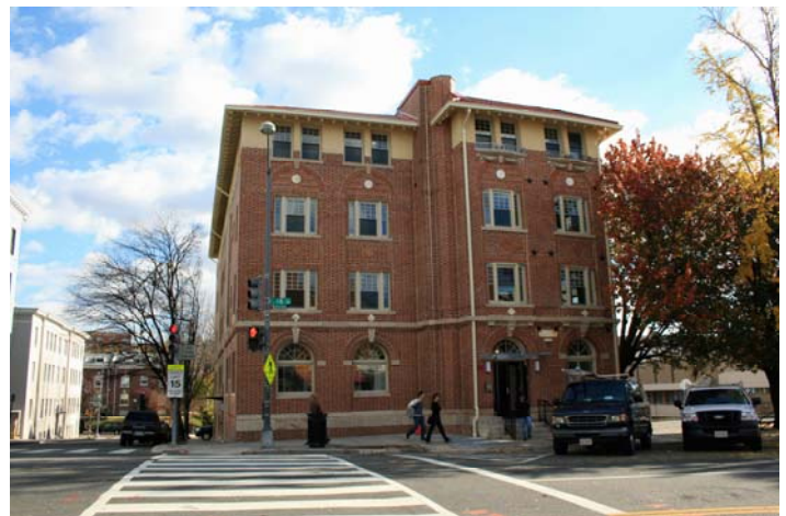
The Sorrento, 2233 18 th Street, NW